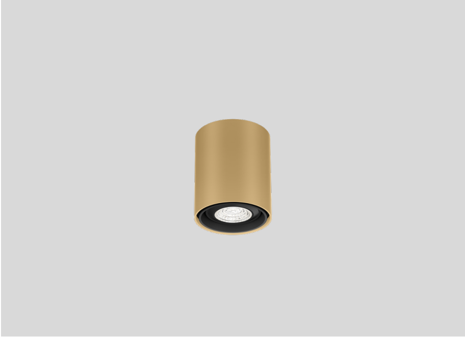
Cylindrical ceiling surface mounted downlight made from die-cast aluminium; surface Champagne; lamp socket GU10; lamp type PAR16; max. 12W; 100 - 240 V; degree of protection IP20; Class 1; UGR ≤ 19; inclusive single inner reflector in Black; lamp not included;